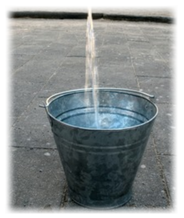
Figure 1: Wikimedia Commons

The United Nations has set the minimum required domestic water needs of an individual at between 20 and 50 liters a day (see: <u>UN water report 2009</u>). 50 liters of water weighs 50 kilograms (110 lbs). Consider that a family of 6 requires 300 liters of water to survive on a daily basis. This amounts to 300 kilograms of water (660 lbs.), which must be carried home 7 days a week, 365 days a year. On an annual basis this adds up to 109,500 kilograms (240,900 lbs) of water to sustain the family. A quarter of a million lbs. of water is a great deal to carry home each year.