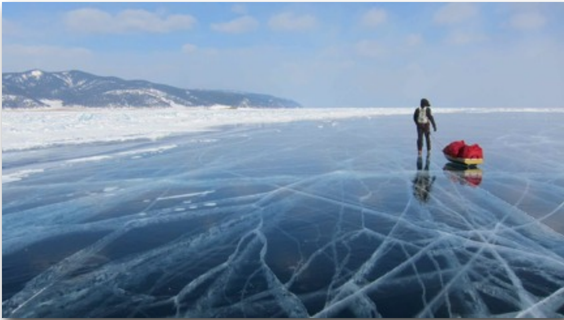
Figure 1: Ray Zahab on Lake Baikal. Standing atop 20% of the world’s liquid fresh water. (source: Kevin Valley i2P).

Imagine an Earth free of water. With no water there would be no lakes. Ray and Kevin (presuming that they could still exist without water!) would have just run the length of the