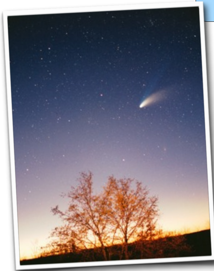
Figure : Photo of the comet Hale-Bopp taken in the vicinity of Pazin in Istria/Croatia in 1997. Comets are principally composed of ice

On March 22, 1998, a stony meteorite landed in Monahans, Texas, about 40 feet from where seven boys were playing basketball. The boys picked up the 2.7 pound stone while it was still warm and called police. Within 72 hours, it was under the watchful eyes of NASA scientists at the Johnson Space Center. Two days and numerous tests later, scientists cracked open the gray rock and found blue and purple halite, a salt crystal similar to table salt. The crystals were up to three millimeters in diameter, the largest halite crystals ever seen by scientists in any extraterrestrial material. Inside the blue crystals was an even bigger surprise—small droplets of water. Scientific analysis confirmed the presence of water inside the crystals. The crystals, turned blue and purple by radiation, are estimated to be as old as the Earth's solar system. (see: meteor )