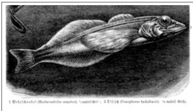
Figure 2: A Golomyankas - Baikal Oil Fish. They disintegrate into a pool of oil and bones when exposed to sunlight

The oxygen rich waters of Lake Baikal help make it home to more unique species of life than any other lake in the world